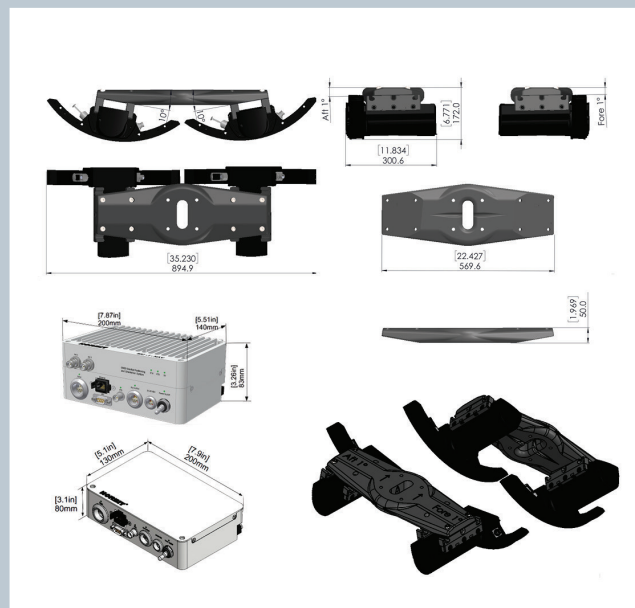
Sonar including bracket (bracket shown in grey)